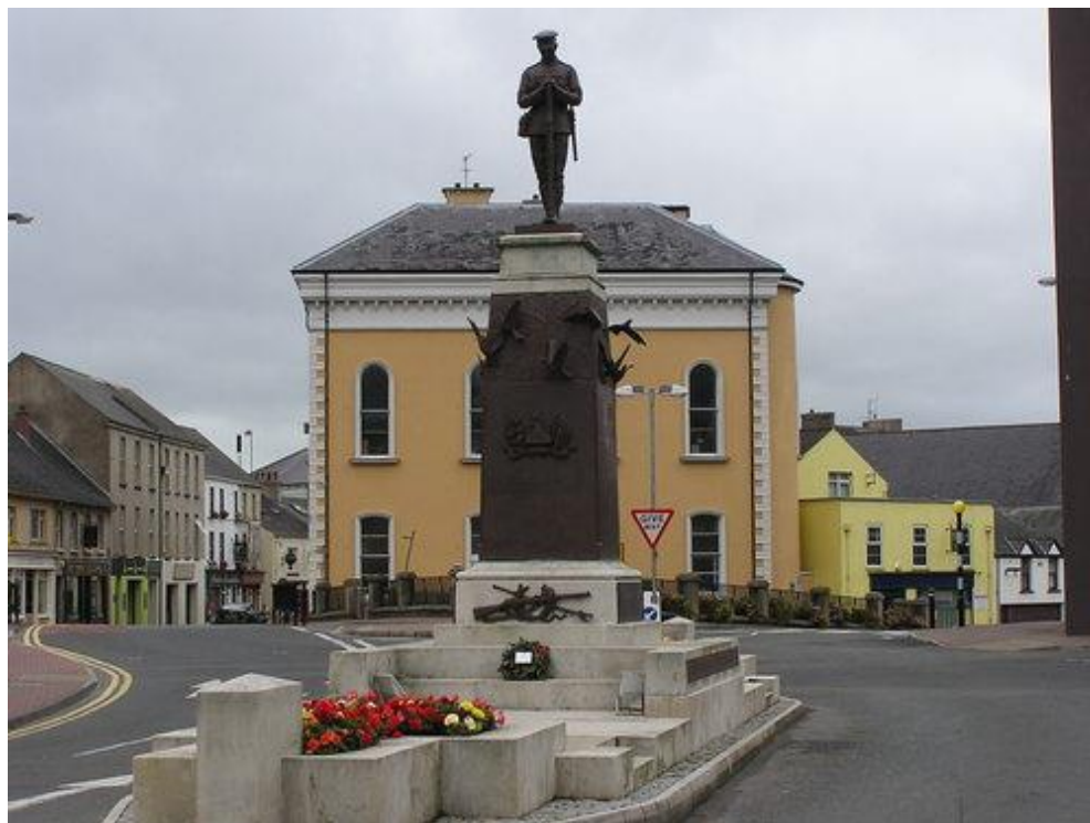
Enniskillen War Memorial