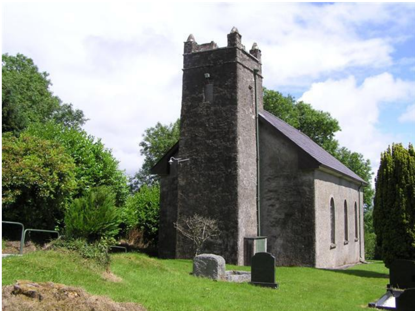
Church of Ireland, Boho

The Church of Ireland Churchyard, Boho contains just one Commonwealth War Grave.